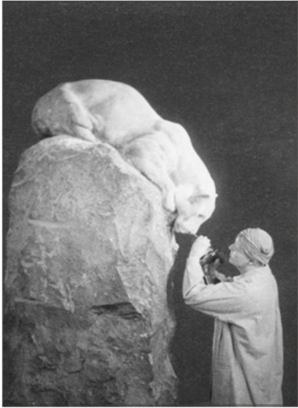
1930 Boston Museum of Fine Arts's film, Sculpture in Stone