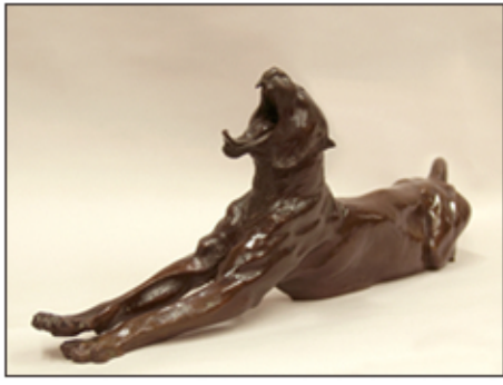
1914 Solo show at Gorham and Co.

1914 Creation of the second Joan of Arc model