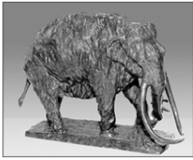
1902-1903 First acquisition by a museum, the Brooklyn Museum, of small animal sculptures