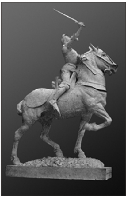
1910 Exhibition at the Paris Salon of a life-size equestrian Joan of Arc , which is awarded Honorable Mention

1908 Exhibition at the Paris Salon of a Jaguar