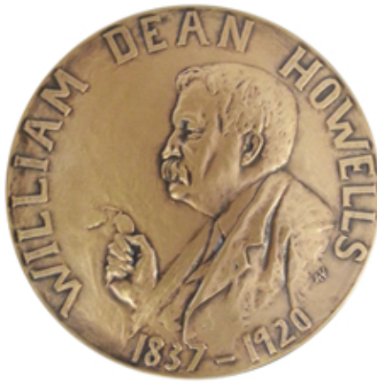
1921 Meeting with Archer Milton Huntington through his commission of the William Dean Howells Medal for the American Academy of Arts and Letters, NY