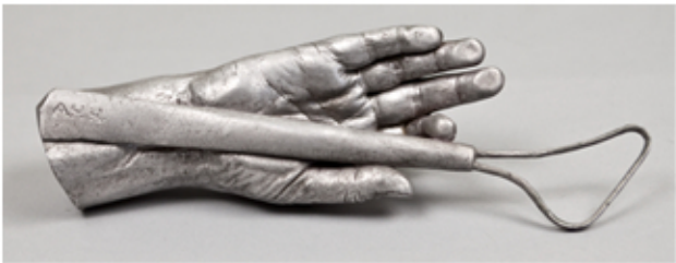
1934–36 New animal sculpture and experiments with aluminum in preparation for traveling retrospective exhibition