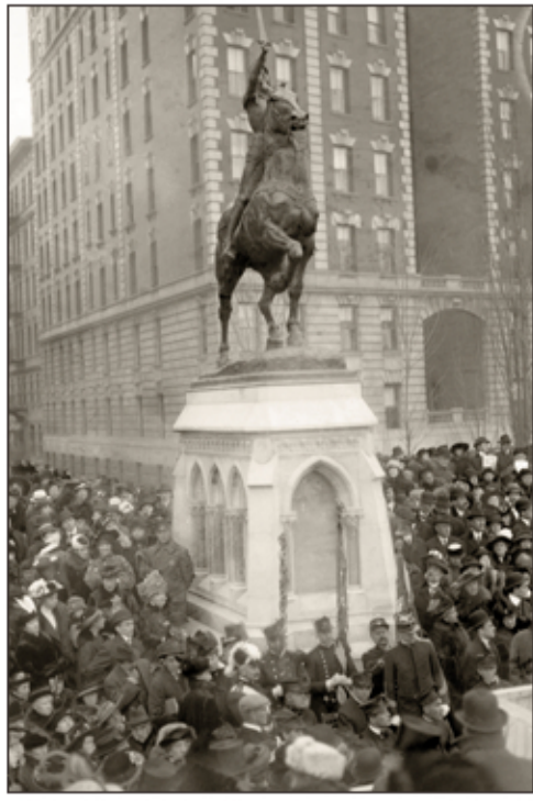
1915 Joan of Arc installed at Riverside Drive & 93rd Street, NY

1915 Silver medal at the San Francisco Pacific-American Exposition