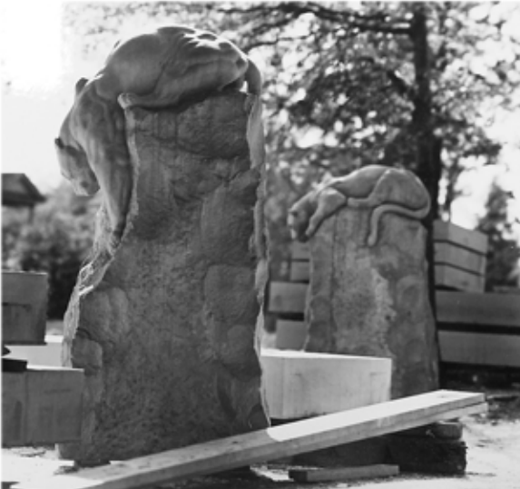
1936 Jaguar and Jaguar Reaching carved in stone for the Bronx Zoo