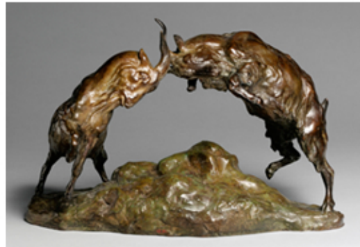
1912 Acquisition by the Metropolitan Museum of Art of Goats Fighting