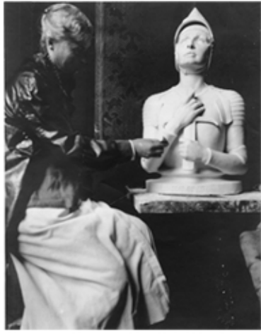
1922 Installation of a Joan of Arc in the Cathedral of St. John the Divine, NY

1922 Exhibition of life-size bronze Diana of the Chase at the National Academy of Design, NY, which wins a Saltus Prize