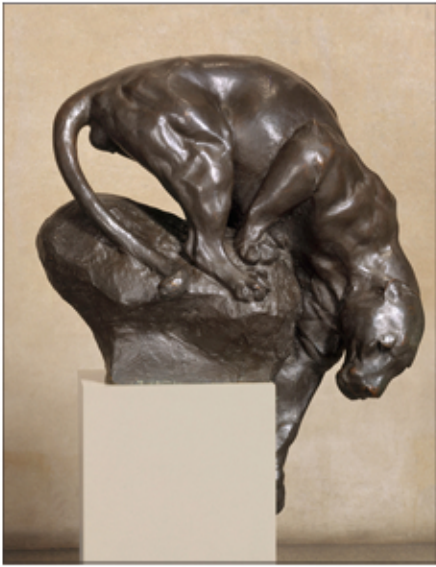
1926 Casting of life-size bronze Jaguars for the Metropolitan Museum of Art

1924 Begins work on the Hispanic Society of New York architectural sculpture